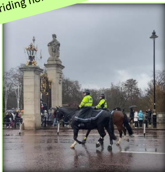
St. James's Park